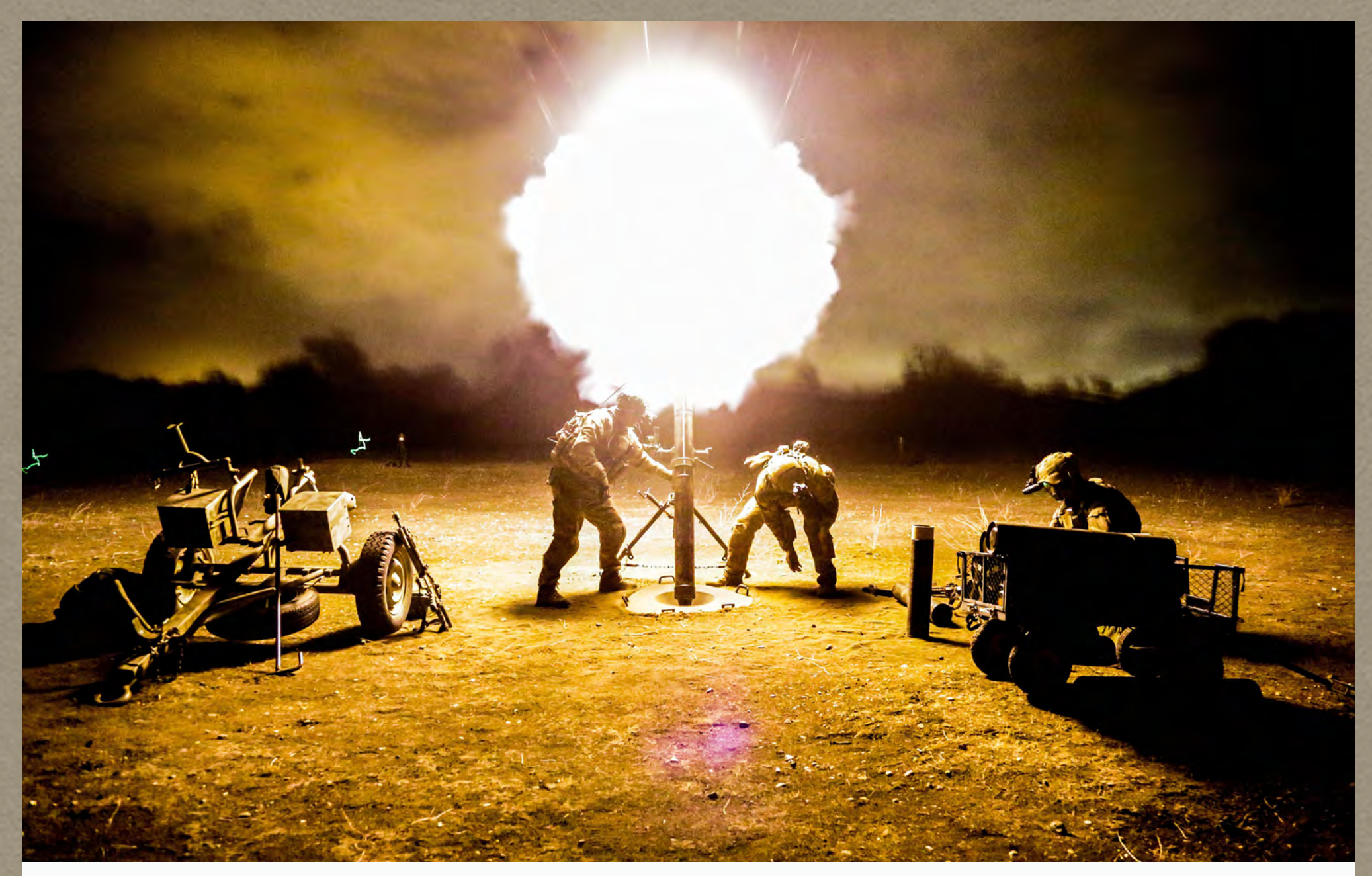
U.S. Army Rangers assigned to 2nd Battalion, 75th Ranger Regiment, fire a 120mm mortar during a tactical training exercise on Camp Roberts, Calif., Jan. 30, 2014. Rangers constantly train to maintain the highest level of tactical proficiency.