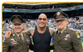
"The Rock" attends the 30 March UFL game.

UFL Championship game: 16 June in St. Louis will feature Army branding and the Impossible Kick interactive display as well as a number of other Army assets and personnel.