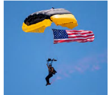
U.S. service members with the Para-Commandos, U.S. Special Operations Parachute Team, perform an aerial parachute demonstration during the Army Birthday Festival at the National Museum of the United States Army, Fort Belvoir, Va., June 15, 2024.