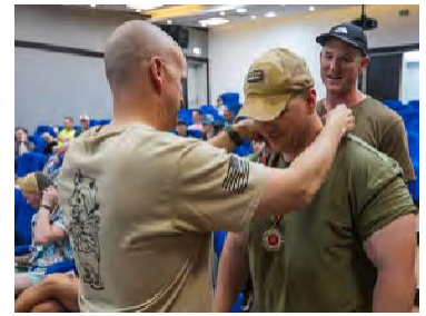
Soldiers build morale and unit cohesion by celebrating Army service with field games and a scavenger hunt.