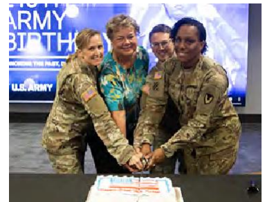
USAFMCOM cutting a birthday cake commemorating the U.S. Army's 249th Birthday at the Maj. Gen. Emmett J. Bean Federal Center in Indianapolis, June 14, 2024.