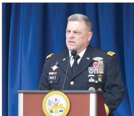
Chief of Staff of the Army Gen. Mark A. Milley speaks to a crowd in the Pentagon courtyard during the Army's Sexual Assault Awareness and Prevention Month Observance Ceremony on March 31.