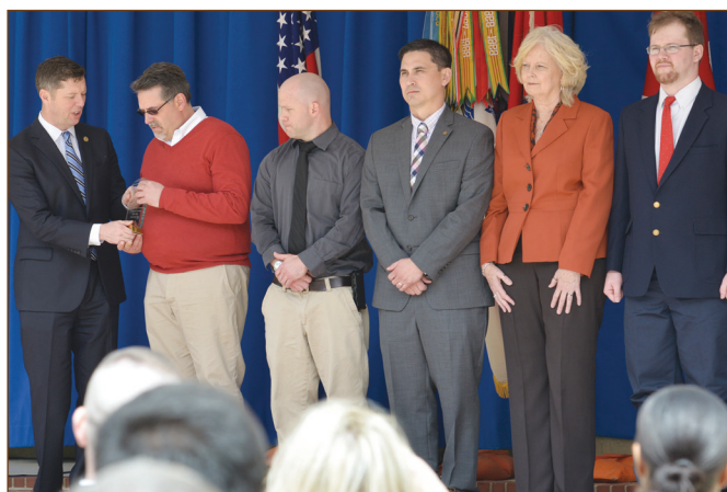
Acting Secretary of the Army Patrick Murphy (left) presents the Department of Defense Sexual Assault Prevention Innovation Award to members of the Combined Arms Support Command (CASCOM) and the TRADOC Mobile team during the Army's SAAPM Observance Ceremony at the Pentagon on March 31. In 2012, under CASCOM, the team created an app for mobile phones that will instantly summon help in the event of a sexual assault.