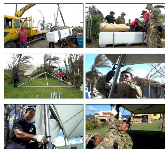
U.S. Soldiers with the 797th Engineer Company, Army Reserve, and members of the Commonwealth of Northern Marianas Islands Department of Fire and Emergency Services build tents for homeowners after Super Typhoon Yutu destroyed their homes Nov. 13, 2018 on Saipan, Commonwealth of Northern Marianas Islands. Teamwork and communication between the services and the CNMI Fire Department were instrumental in relief efforts after Yutu.

The below rubric will be used in the DVIDS system to judge all entries at the Major Command (MACOM) and higher. Judges will be provided specific guidance via separate correspondence.